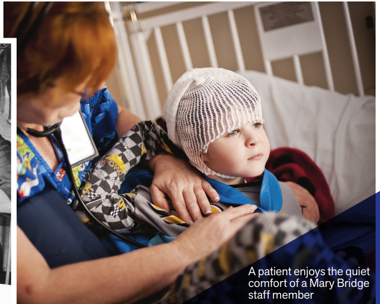
A patient enjoys the quiet comfort of a Mary Bridge staff member